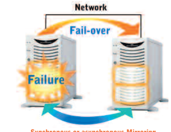
Synchronous or asynchronous Mirroring Data / Applications