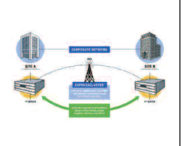
Disaster Recovery plan